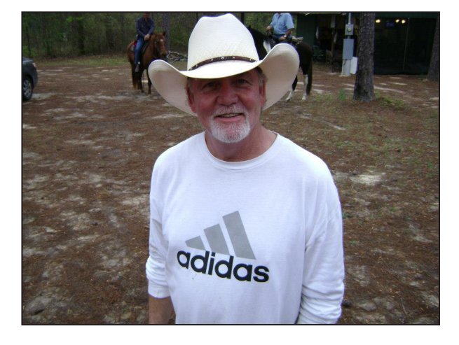
March 23rd at Kisatchie Natl Forest