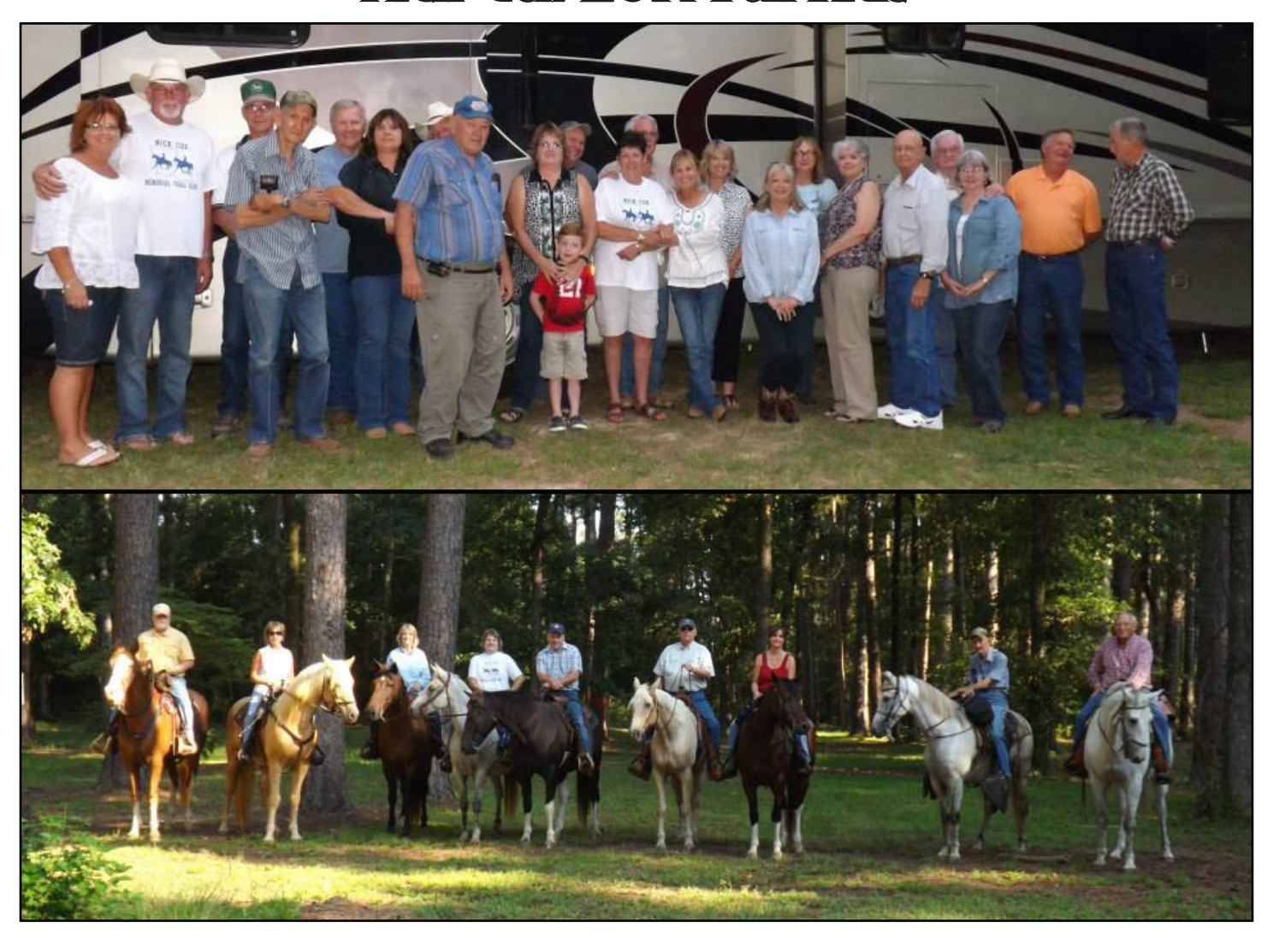
Roaning Creek 2014 Spring Ride